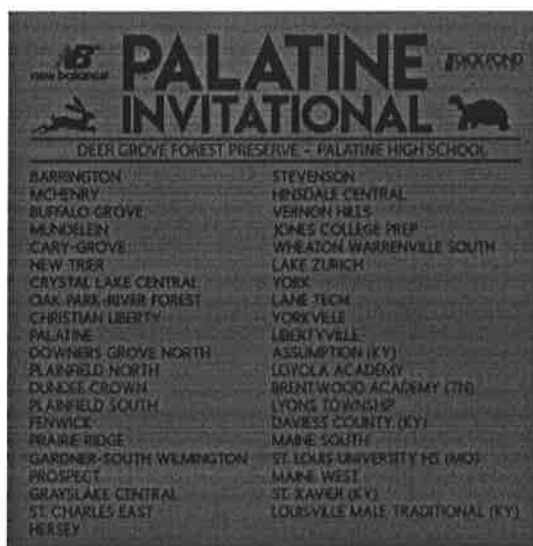
Back of T-shirt